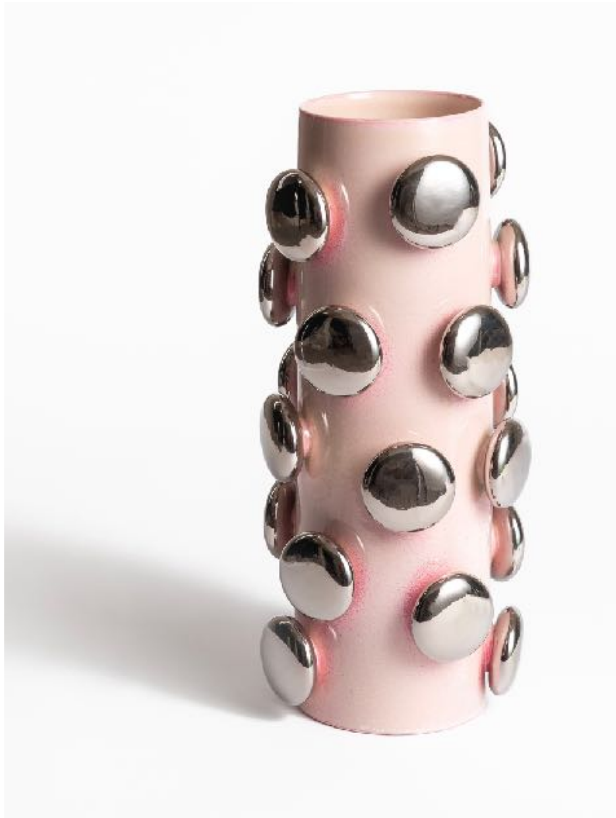
The enlightening quantum, Ceramic, 17x17x 45cm