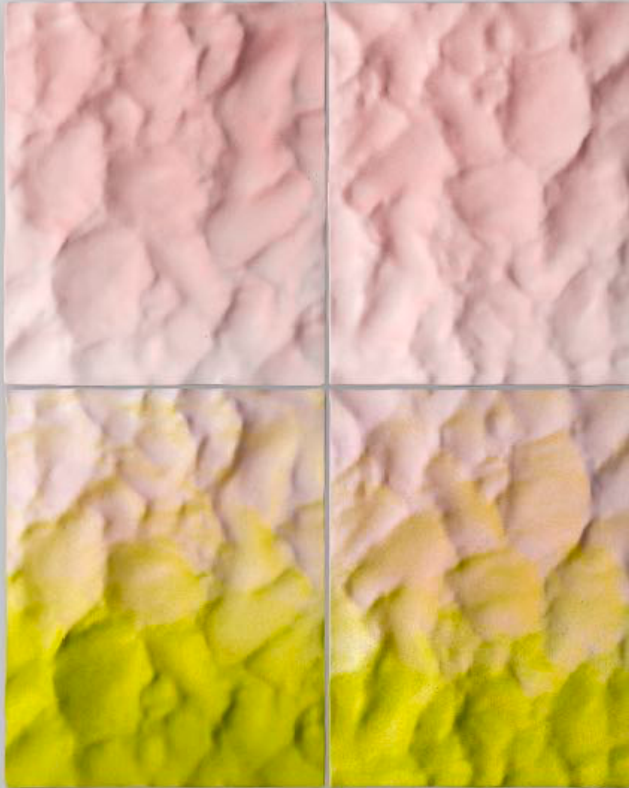
Floating to the opposite direction , Ceramic, 27x33x3cm X4