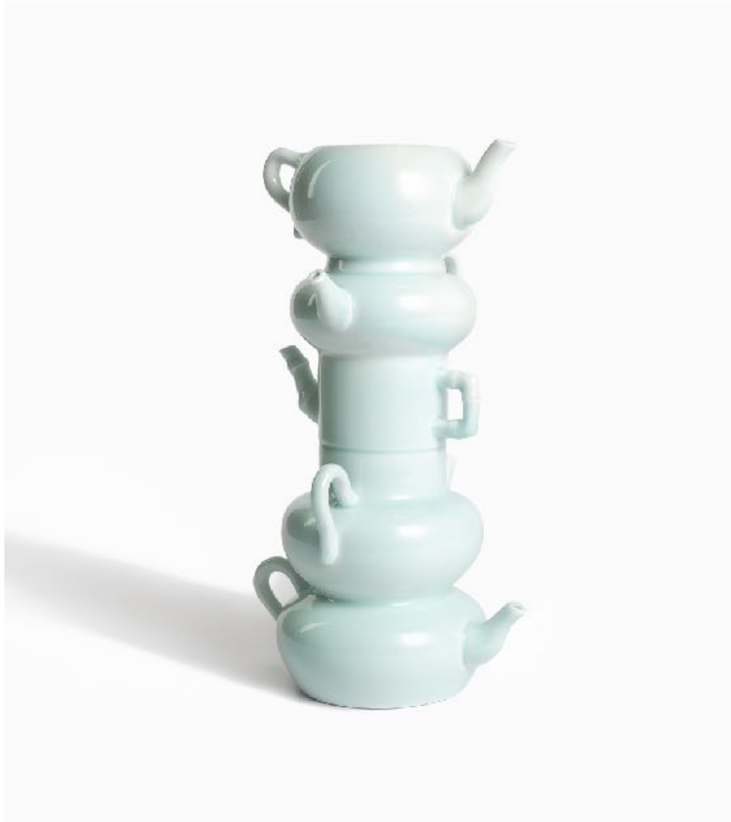
The enlightening quantum, Ceramic, 17x17x 45cm