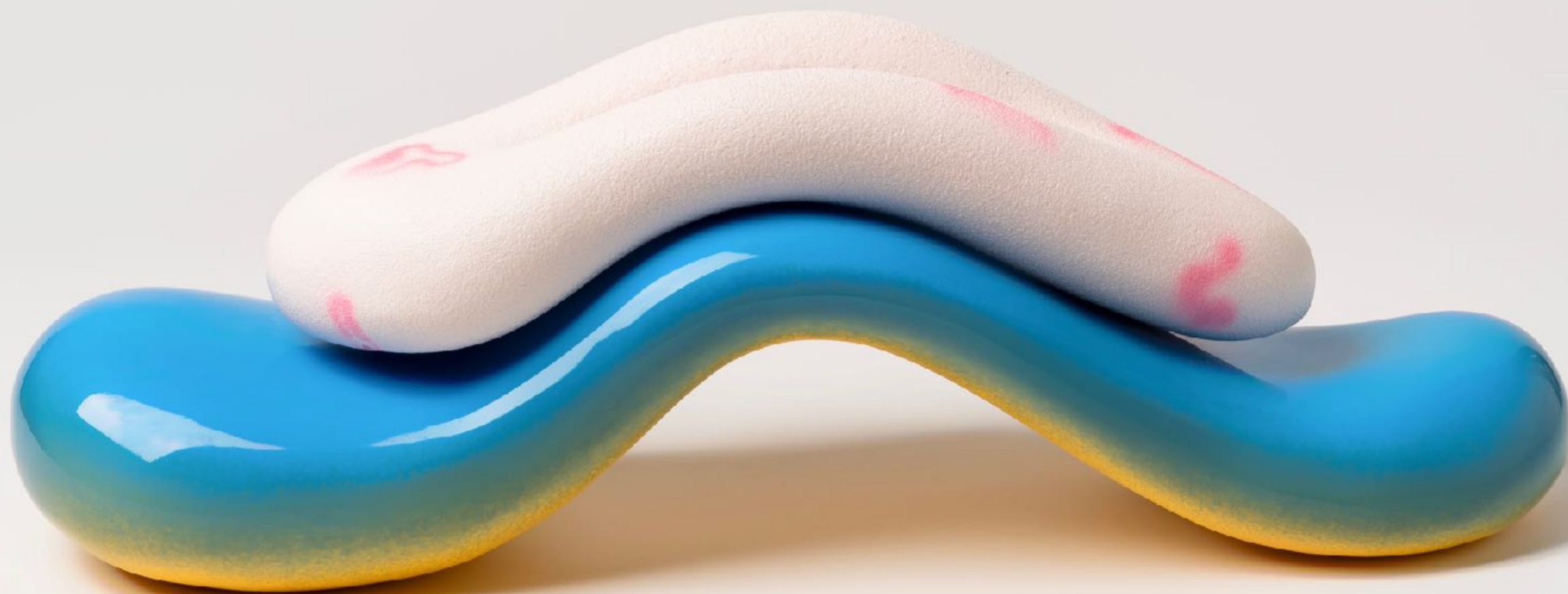
Blue Alpha, Pink Omega, 45x14x15cm, Ceramic, 2020