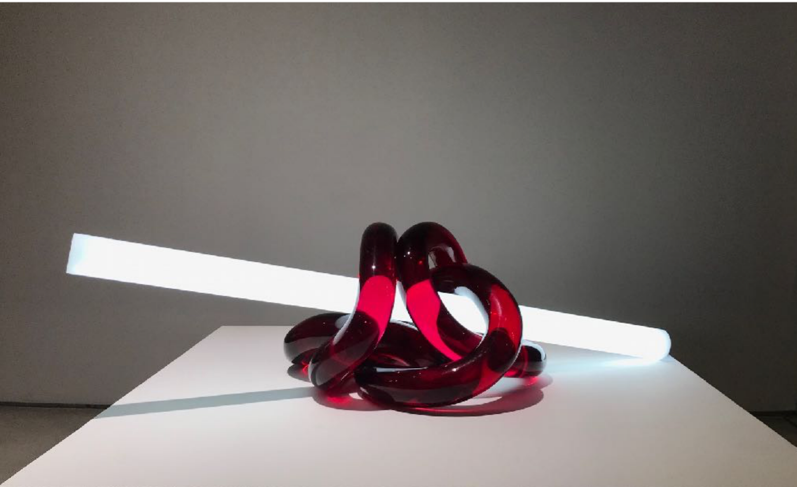
Tangled Love, Variable Size, Crystal Resin, 2019