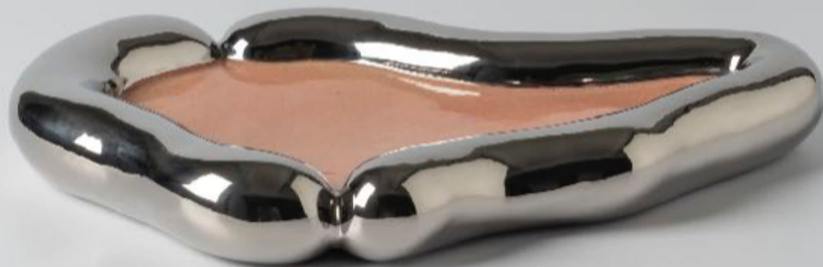
Melted Ice Cream and Stupid Ghost, Ceramic, 31x22x3cm