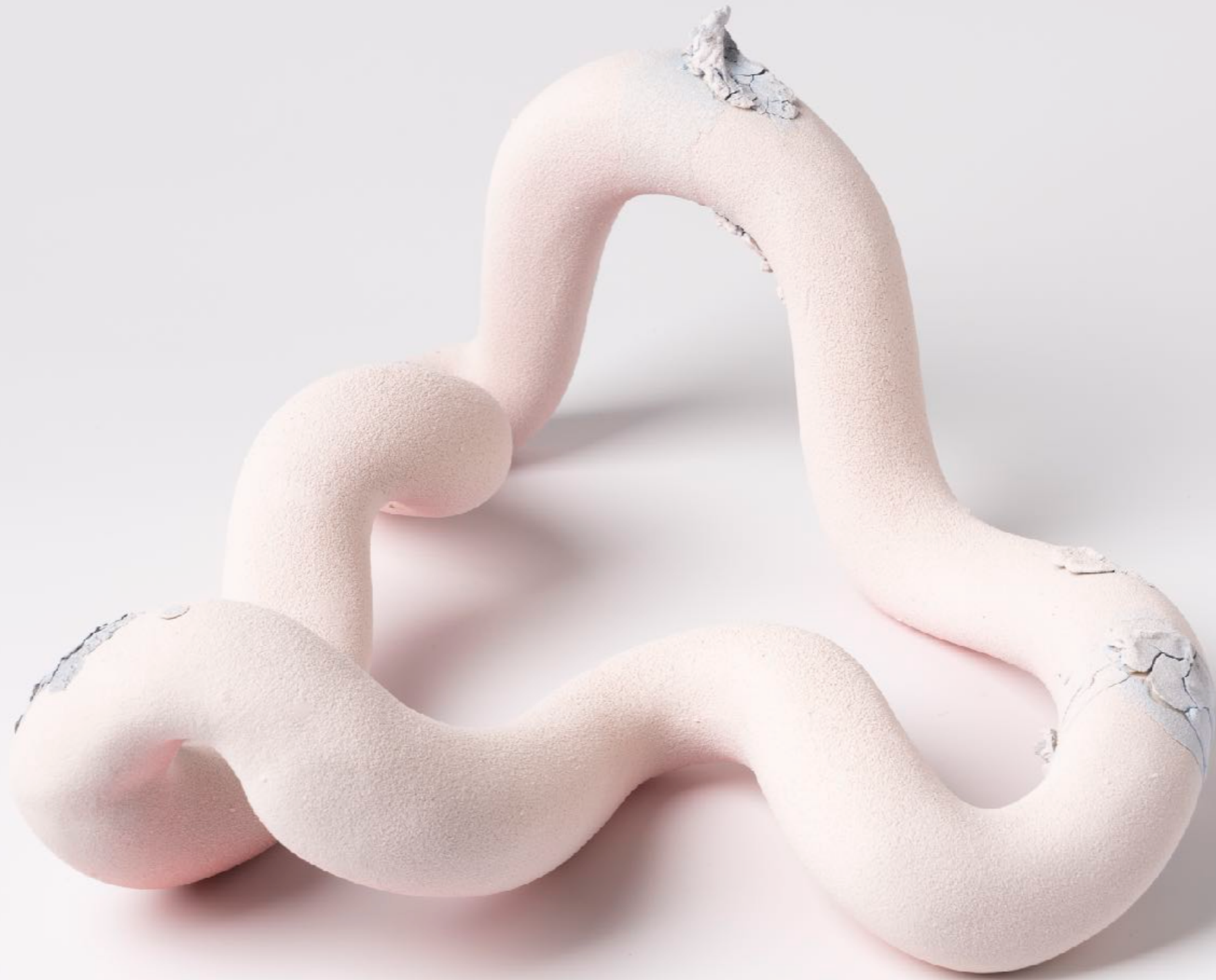
Tip of a wave, 34x30x20cm, Porcelain, 2020