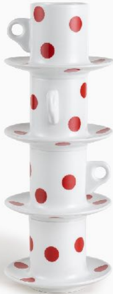
Dangerous liaisons, Ceramic, 14x14x 39cm