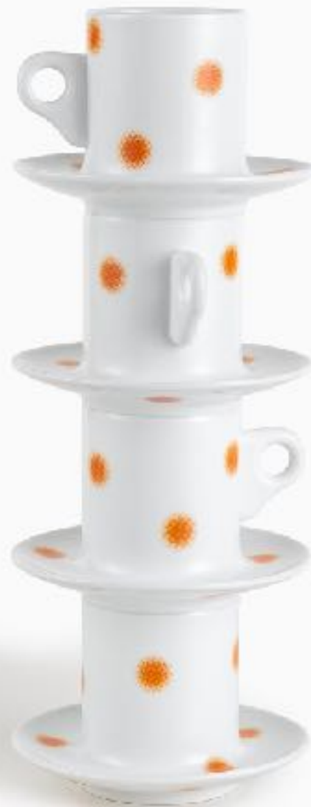
Dangerous liaisons, Ceramic, 14x14x 39cm