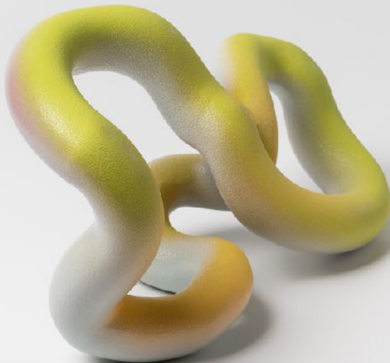
库尔勒的梨, 40x28x17cm, Porcelain, 2020