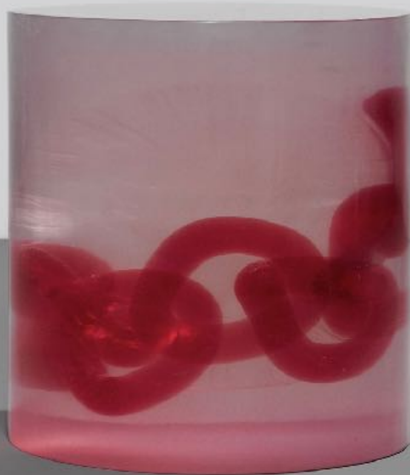
Seeing through your illusions - Sunset , 42x42x44cm, Crystal Resin, 2019