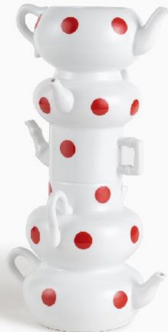
The enlightening quantum, Ceramic, 17x17x 45cm