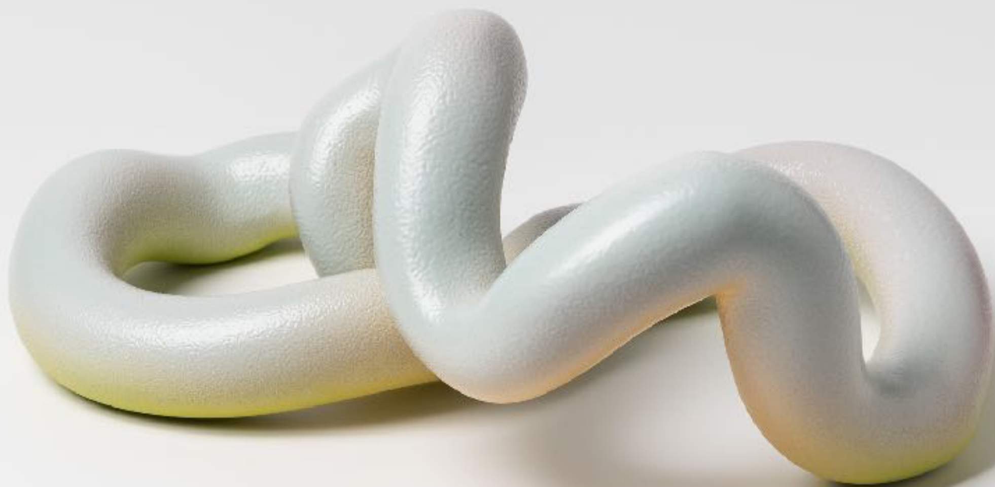
库尔勒的梨, 40x28x17cm, Porcelain, 2020