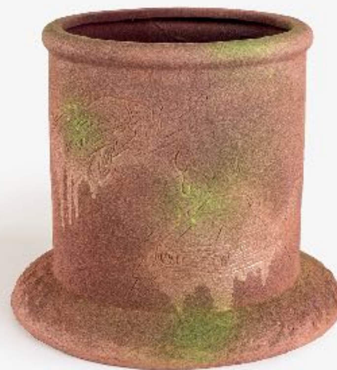
Sweet Trembling , Ceramic, 38x38x42cm