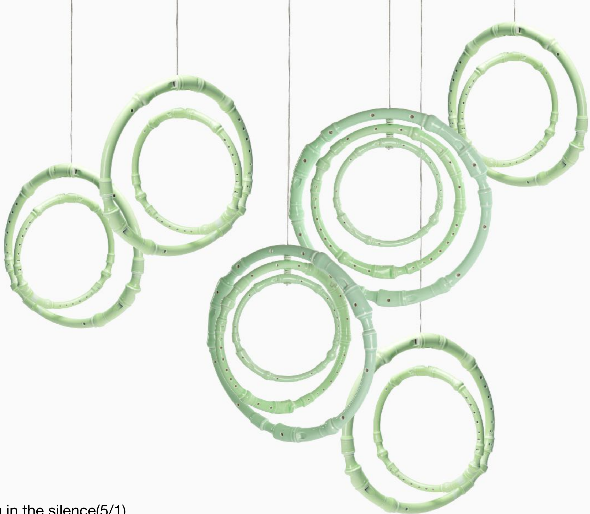
Singing in the silence(5/1) 45x45xx4cm(3rings), 32x32x3cm(2rings)glazed Porcelain, motor,2021