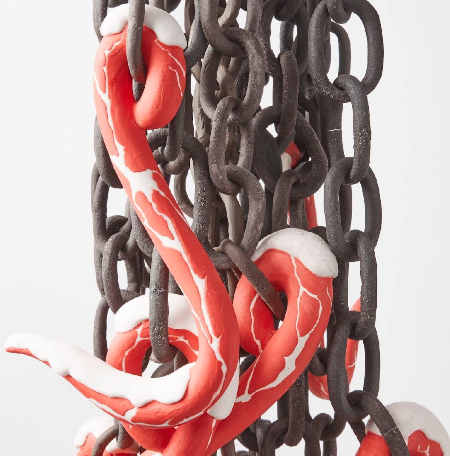
王画, Wang Hua, 肉, 钩子. 陶瓷, 伯利利安釉, 34 x 35 x 117 cm, 2018 Meet, Hooks . Porcelain, coloured parian slip, 34 x 35 x 117 cm, 2018