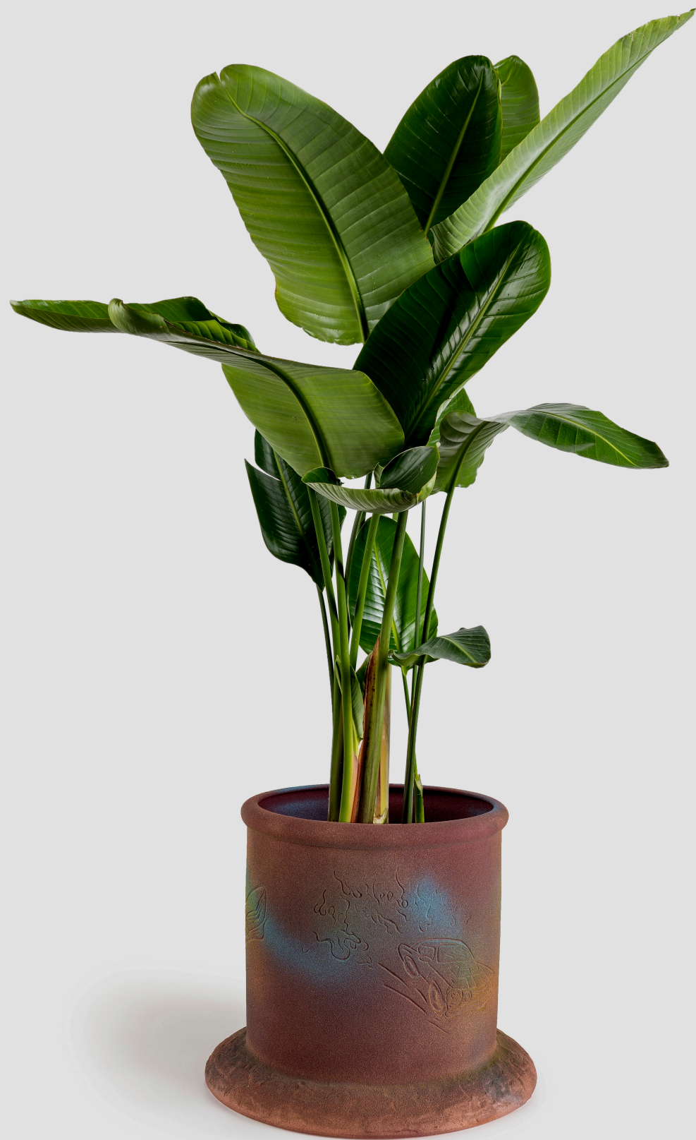
Sweet Trembling , Ceramic, 38x38x42cm