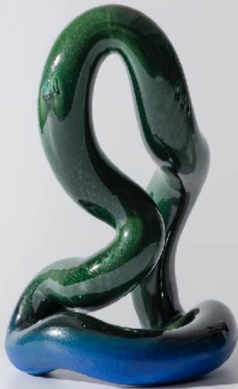
Mallow&Shallow , Ceramic, 20x 33x25cm