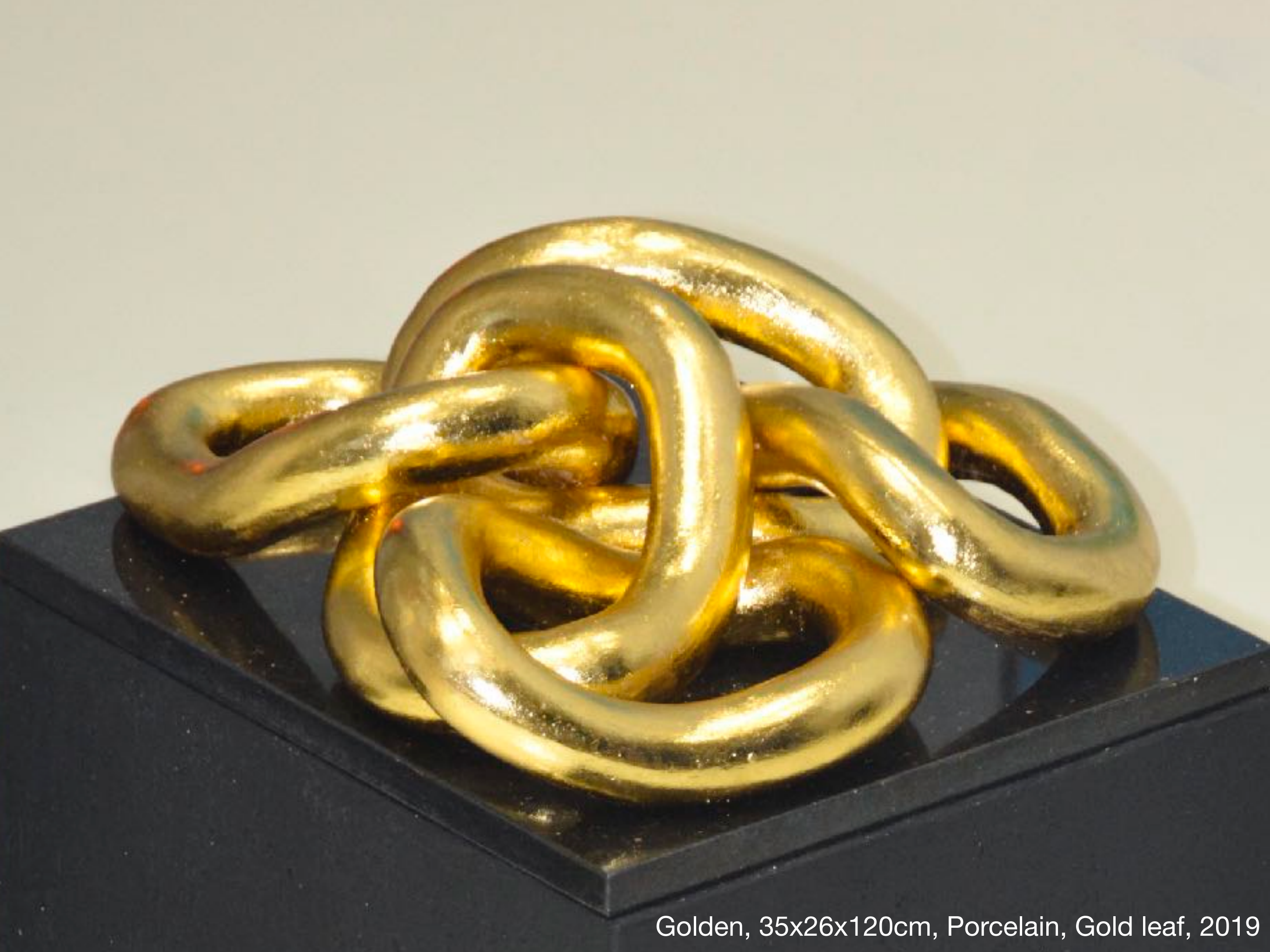
Golden, 35x26x120cm, Porcelain, Gold leaf, 2019