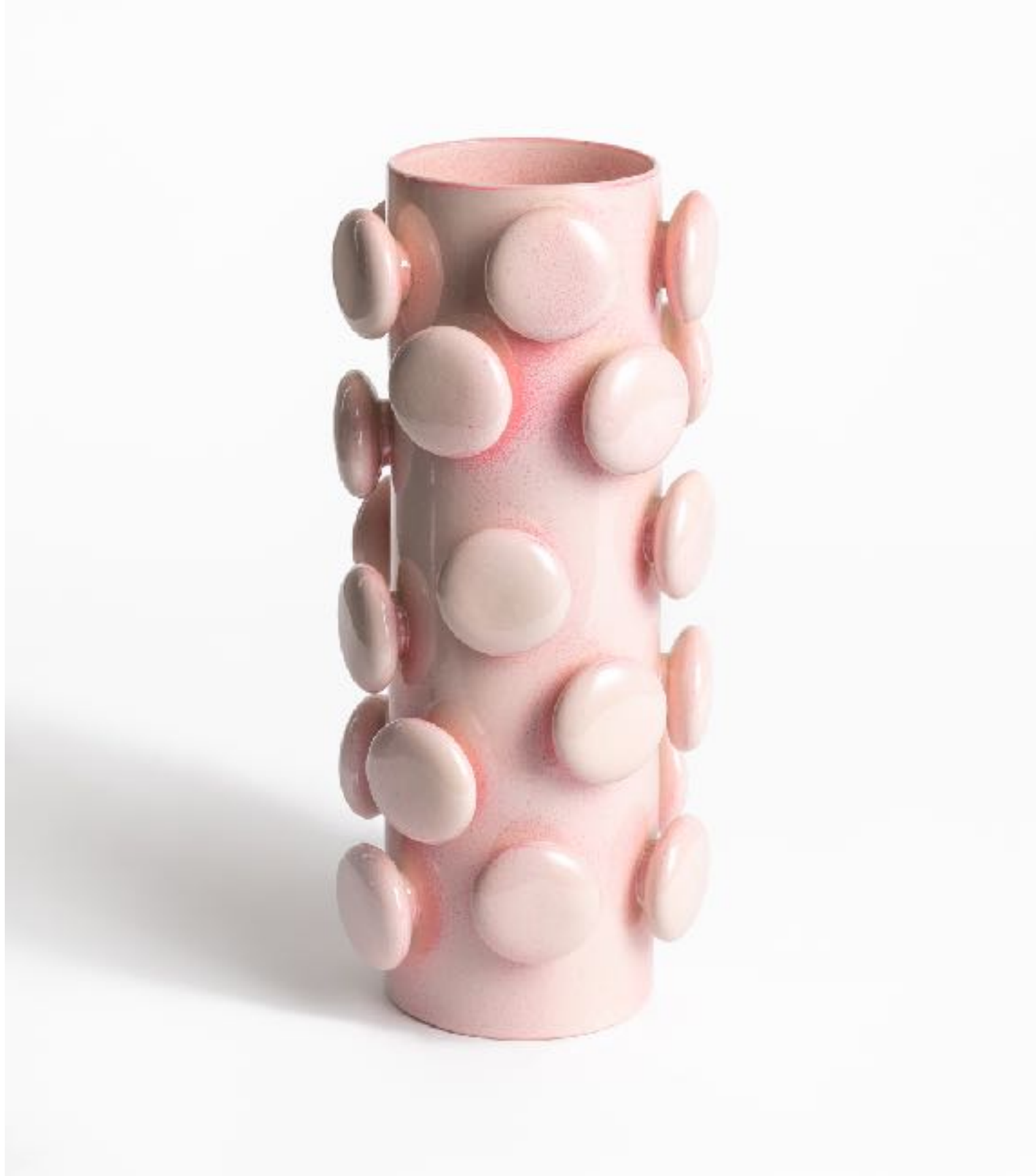
The enlightening quantum, Ceramic, 17x17x 45cm