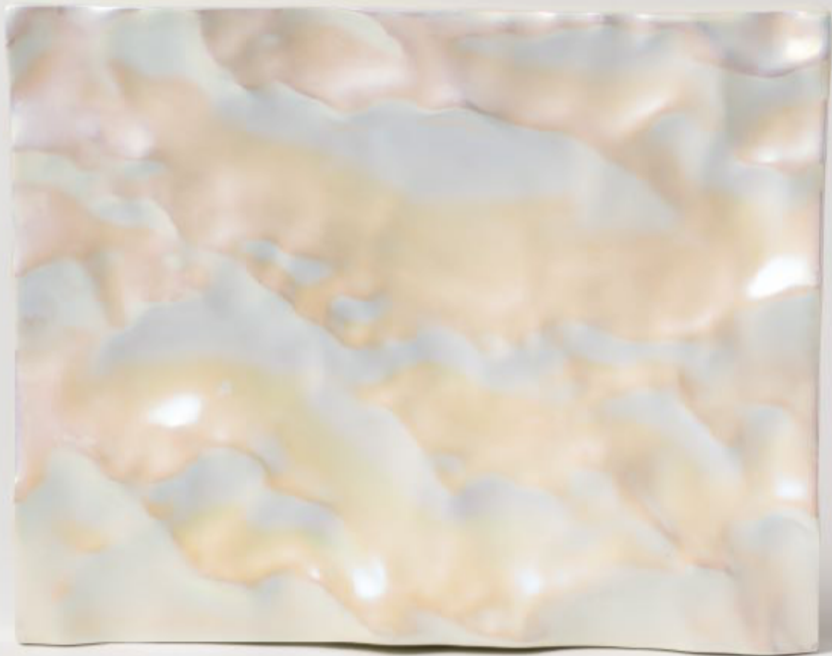
Floating to the opposite direction , Ceramic, 27x33x3cm