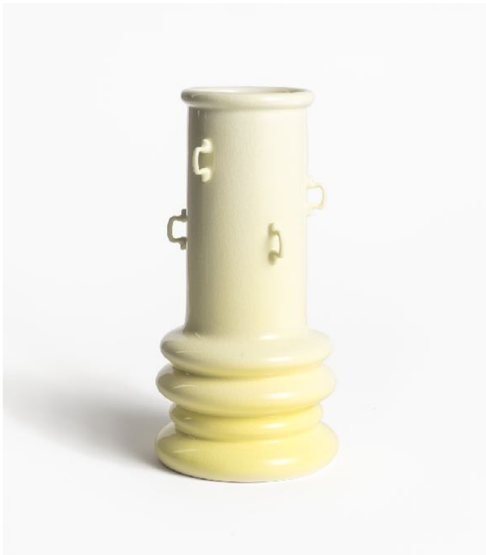
the unspoken, ceramics, 18x18x42cm, incl. 12 Ceramic pendant