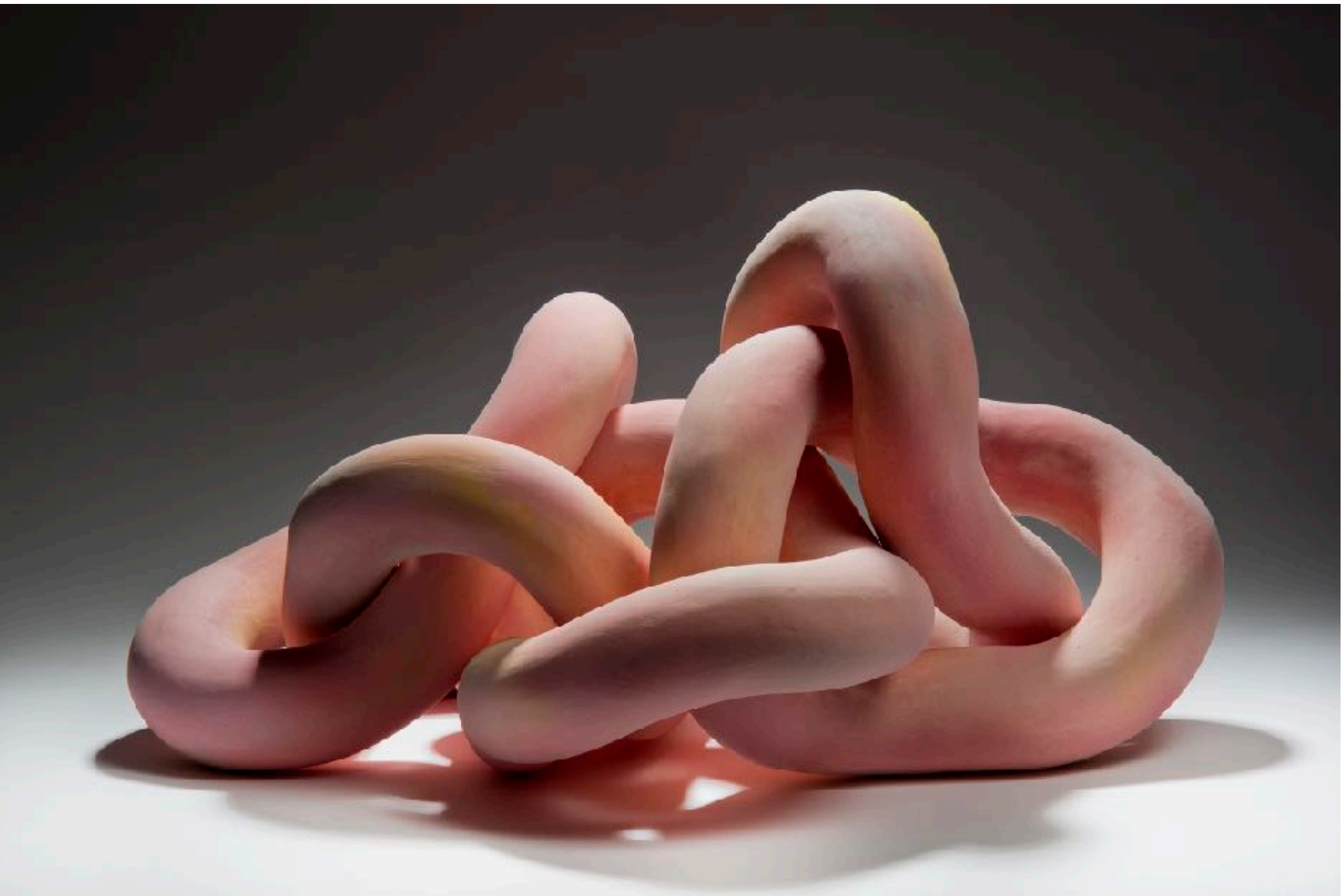
Pink Illusion, Earthenware , 25x23x64cm, Underglaze colour, 2018