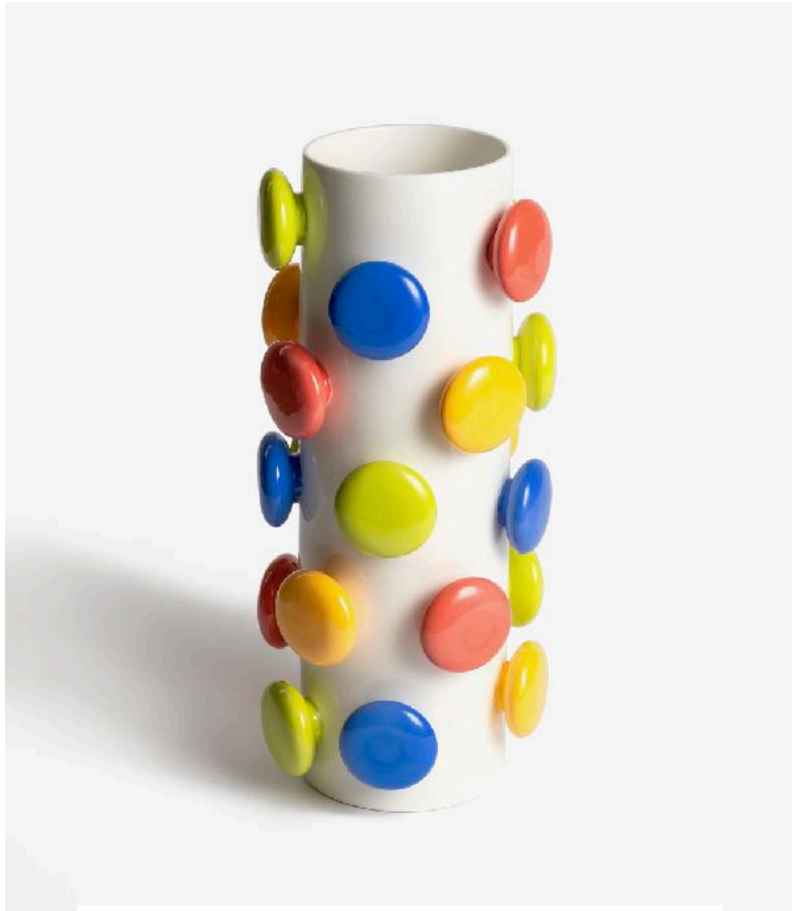
The enlightening quantum, Ceramic, 17x17x 45cm