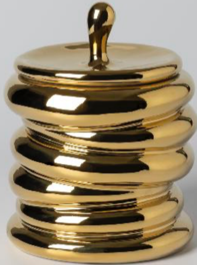
Hydraulic Fluid, Ceramic, 22x17x17cm