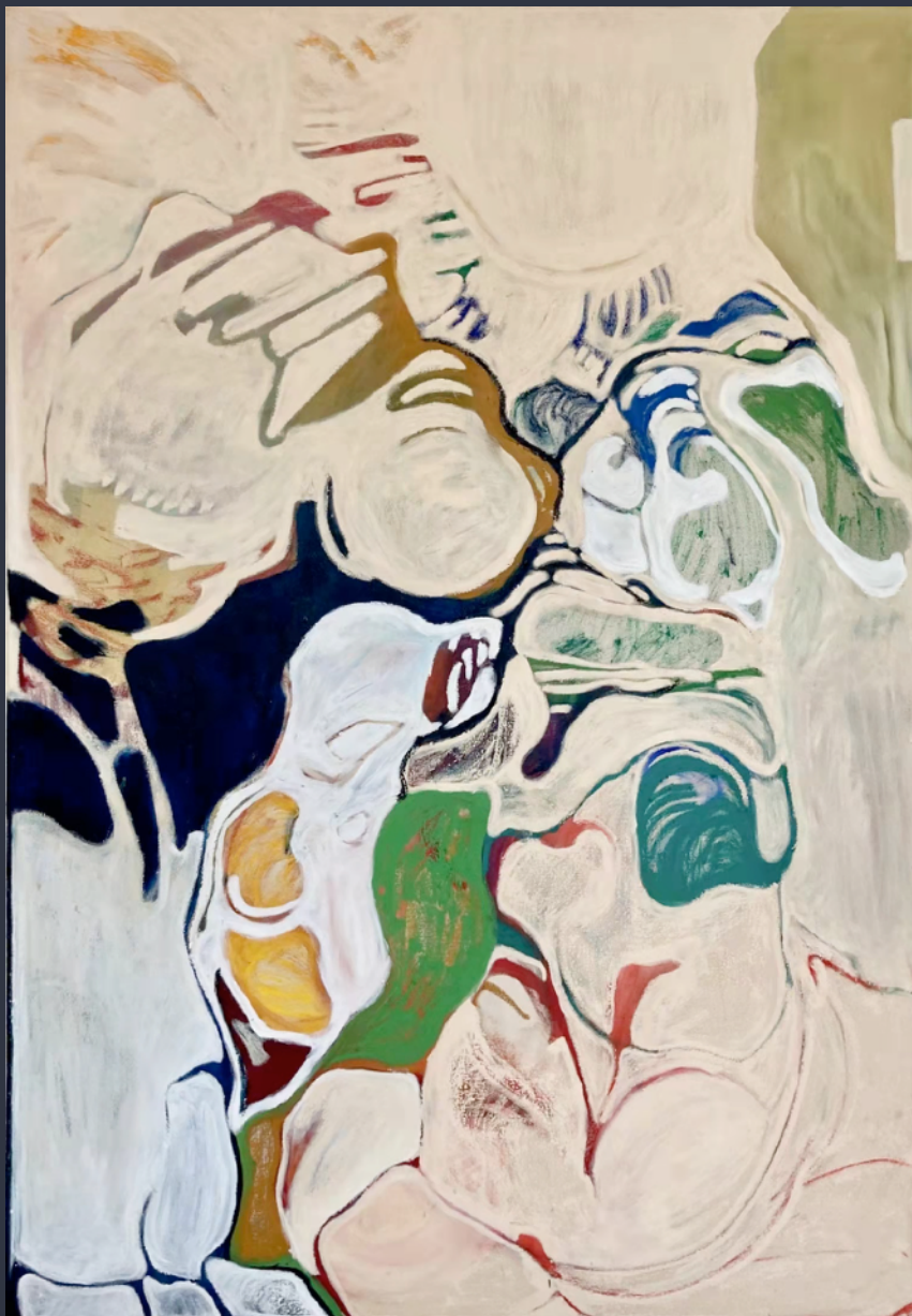
疊加态 / Superposition