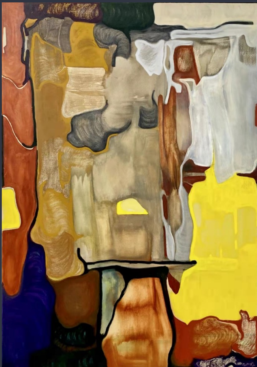
投影池 II / Projection pool II