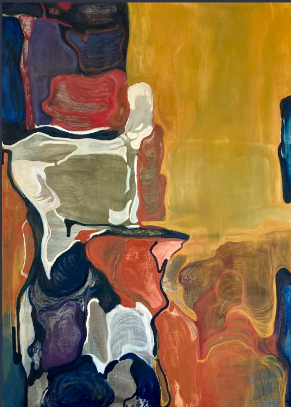
投影池 II / Projection pool II