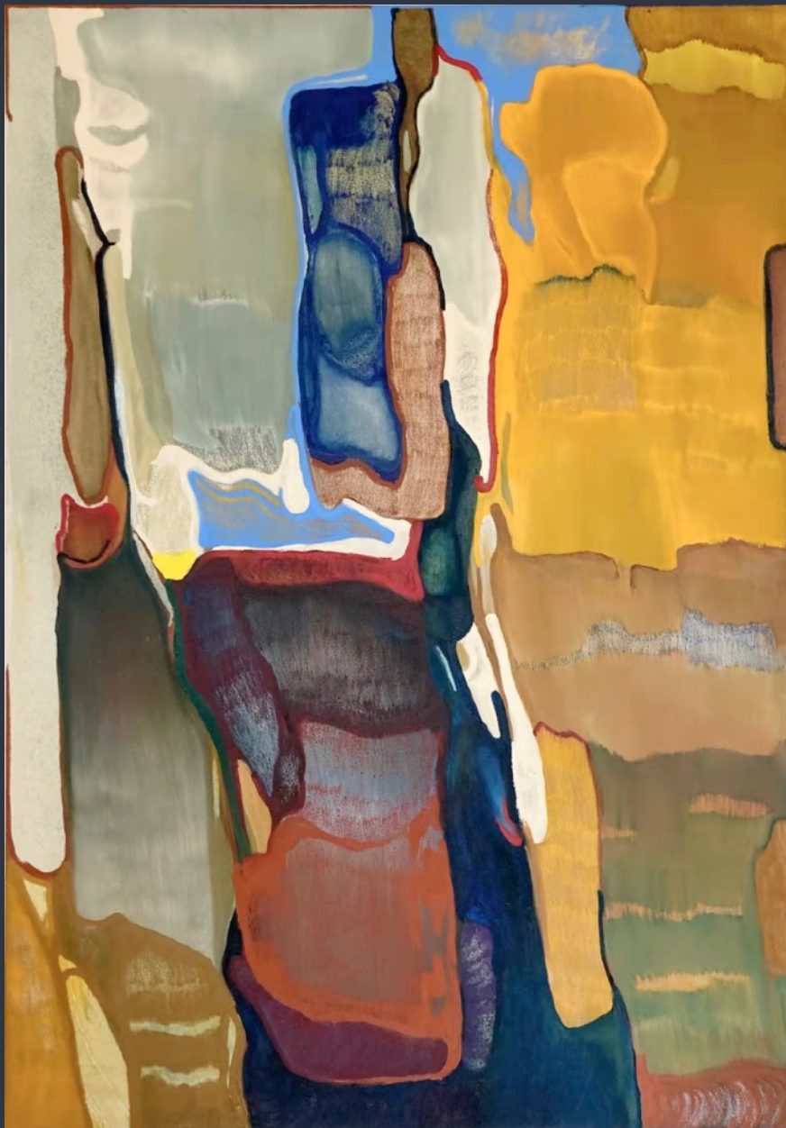
投影池 I / Projection pool I